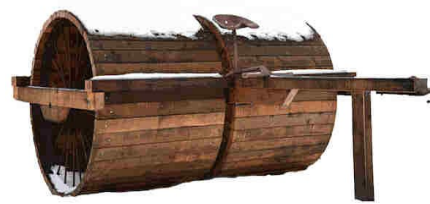
The Bartlett Snow Roller—Restored 2015