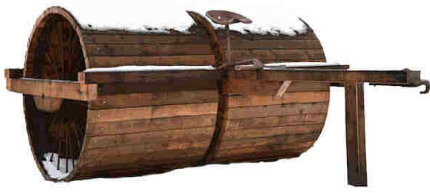
The Bartlett Snow Roller—Restored 2015