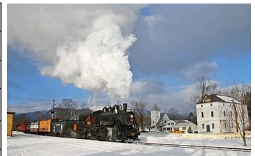
Steam train passes through a snow covered Bartlett Village