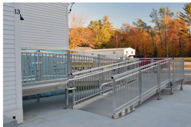
The addition of the ADA ramp makes the museum accessible to everyone. Above left, site work is underway; above center, Coleman Concrete pours the slab for the ramp and sidewalk connecting to the parking lot; above right, a worker is assembling the ramp; left, the finished ramp ready for use