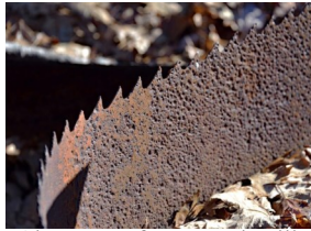
Close up of a rusted mill sawblade