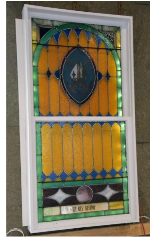
The stained-glass window refurbishment took several steps to complete; to the left, a sash with the old glazing removed; center, a worker sands the layers of paint off the sash; right, the prototype lightbox with the window for the “Rt Rev Bishop”

ADA Mobility Ramp: From the outset of this project, we intended to make this museum accessible to all visitors, regardless of their mobility status. To that end, we have installed an ADA compliant mobility ramp. Site work for the ramp was completed in June 2022. In September 2022, a concrete slab was poured to support the ramp. With that slab, we also included a sidewalk that will connect the ramp access and front sidewalk to the museum with the parking lot adjacent to the building. Coleman Concrete donated the concrete for the slab and sidewalk. In October 2022, the ramp was assembled by two BHS volunteers. Ramp assembly was analogous to building a large erector set. The ramp is connected to the building with an access door into the front foyer of the building.